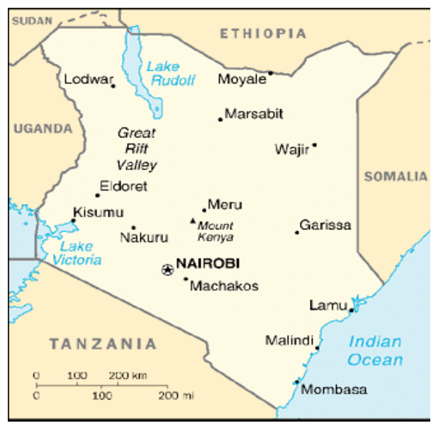
Map of Kenya 1

These strategies include reducing deaths through HIV and AIDS, enhancing support to orphans and vulnerable children through policy development and support of safety nets such as cash transfer scheme for OVC.