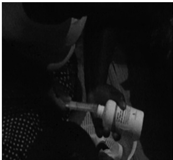
Figure 2. Dose measurement of 3TC taken at an angle. The image illustrates the caregiver of a suppressed child on ART taking a measurement of 3TC at a horizontal angle.

underutilised amongst the caregivers (only used 15 times across 56 observations) (Table 2). Observation revealed that syringe nozzles were used more frequently by caregivers of children newly initiated (observed six times) and suppressed on ART (observed seven times) compared to unsuppressed children on ART (observed twice). Fewer instances were observed among those with unsuppressed VLs as a large proportion was receiving LPV/r via syringe only.