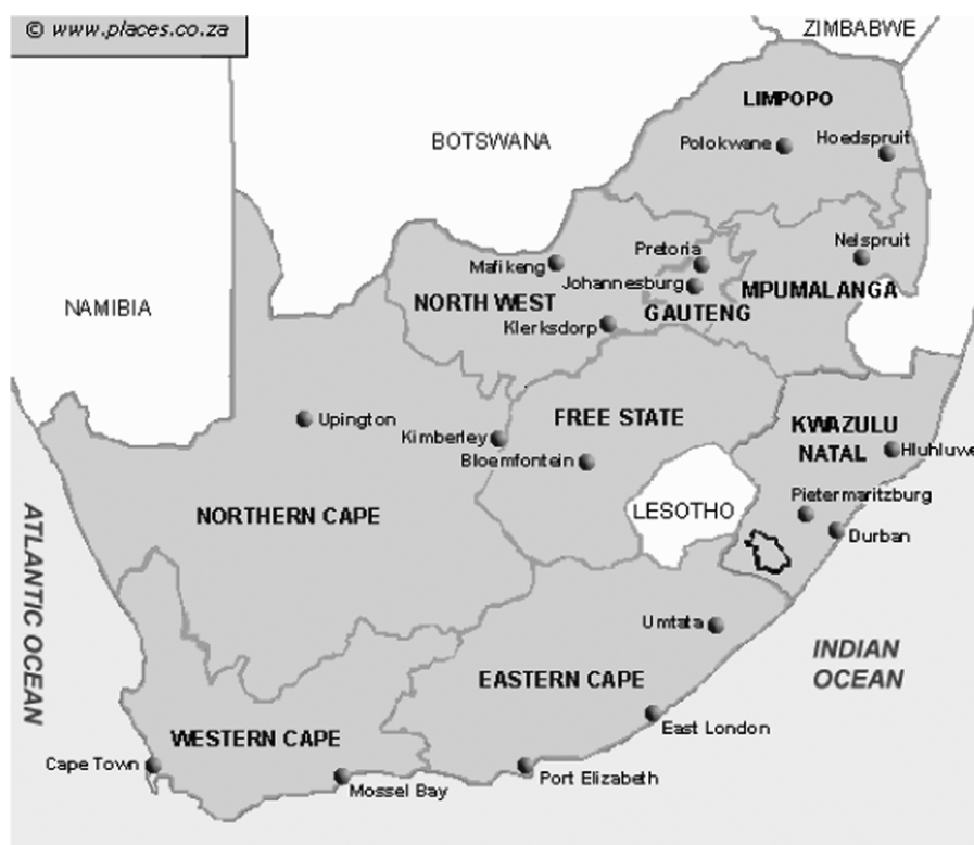
Figure 1. Map of Free State Province, South Africa (SA Places, 1997).

HIV counselling usually takes place in the facilities after obtaining consent from the parents/guardian of exposed children.