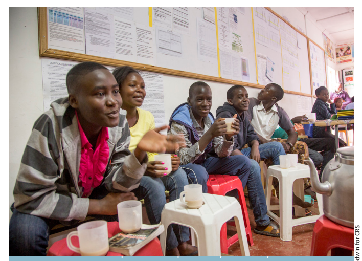
Initiative Response (FAIR) in Nakuru, young people enjoy tea and are linked to a range of services that include HIV testing and counseling, HIV prevention, life skills education, care and treatment and

Leveraging this strength, APHIAplus CCCs engage HIV-positive CHVs as link desk volunteers to facilitate referrals and client