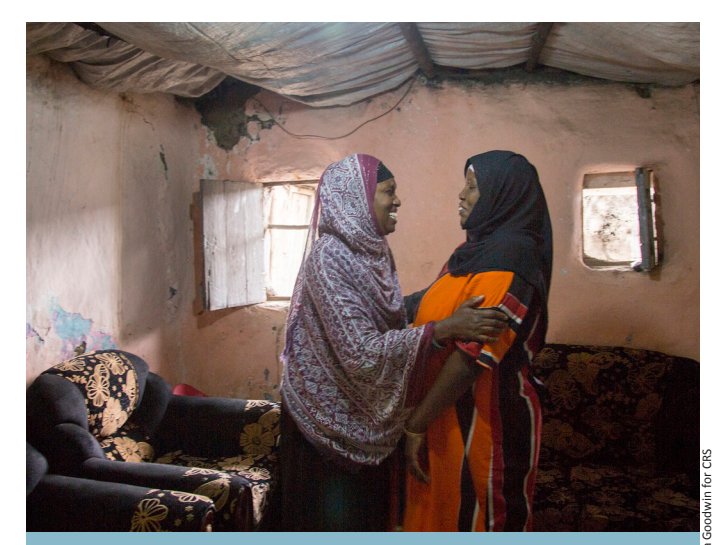
Establishing a relationship with regular home visiting is a critical component of the APHIAplus program in Bondeni, a low-income settlement in Nakuru with a large Muslim population.

The data entry officer then enters the data into the OVC Longitudinal Management Information System (OLMIS). Analysis of the household assessment data helps determine each household's level of vulnerability, and determines the service package each should receive. However, determining the appropriateness of some services, such as economic services, requires more sensitive analysis and analytic tools. Depending on their needs and resources, families may be eligible for enrollment in National Health Insurance and/ or relevant social protection programs for highly vulnerable households, savings and internal lending communities for the moderately vulnerable, and microfinance institution linkages for less vulnerable households.