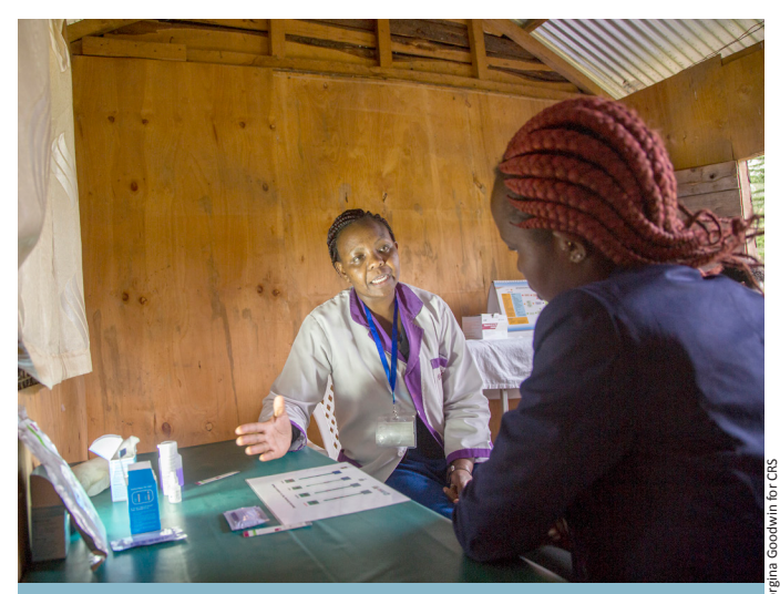
At this "Youth Friendly Centre" in Nakuru town, staff are trained specifically on pediatric and adolescent testing and counseling

The APHIAplus program incorporates clinical data drawn from viral load monitoring to fully understand each child's response to his/her treatment regime. Through its strong partnership with the MoH, the APHIAplus program M&E officers have access to web-based data from three national referral laboratories, where they extract viral load test results on program beneficiaries for entry into the program's OLMIS. Access to this information ensures prompt intervention for enrolled children when needed. For example, if a child's adherence to medication is confirmed by the data obtained from both the Child Status Monitoring and OVC Retention Monitoring forms, but the child's viral