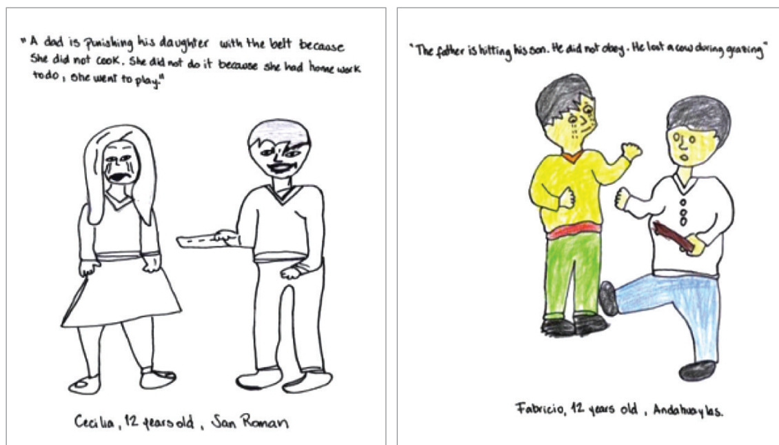
Figure 3: Children's drawings of physical punishment (Peru)

Fabricio: Because I cry. (Rural boy, age 13, Andahuaylas, 2014).